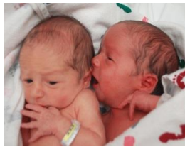
Twins born in Colorado. Legally “abortable” minutes before this photo.

In late term abortions at 22 weeks, the baby is usually dismembered while alive. After 24 weeks, the babies are killed before they are delivered. Typically, a poison is injected into the baby or the amniotic fluid that results in death over an agonizing period of minutes to up to 24 hours. In either form of late term abortion, death is excruciating and cruel.