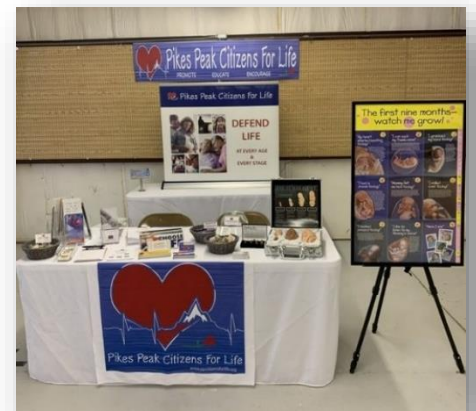
Our Booth at the El Paso County Fair